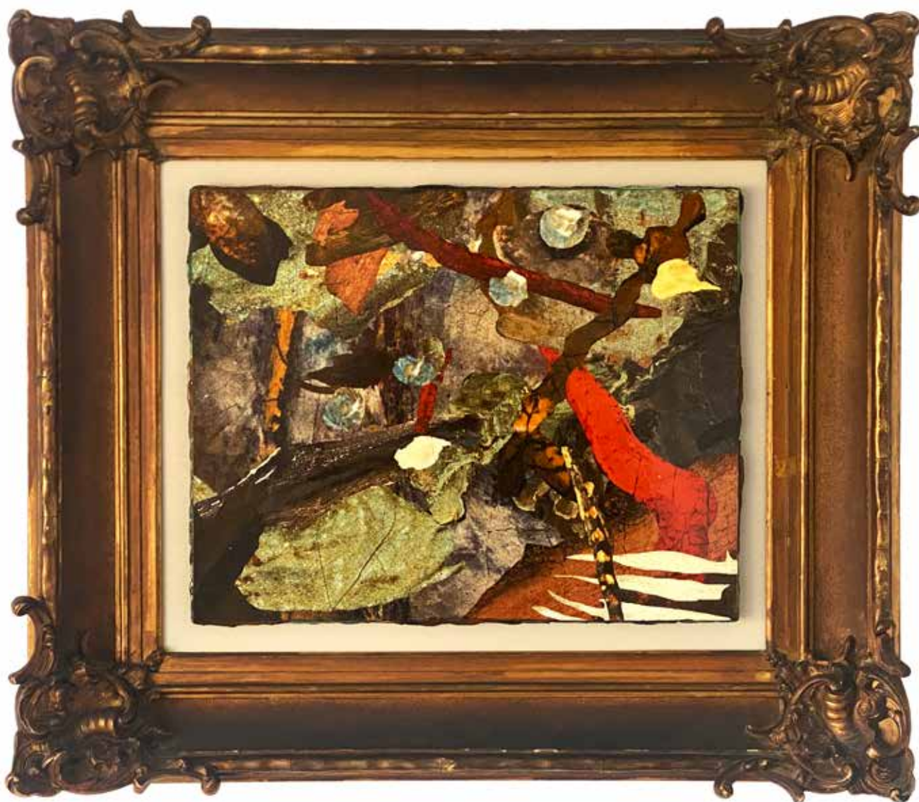
Remon de Jong Allegory of the passing storm